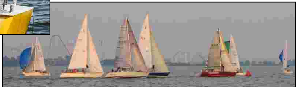
Right: Close quarters on a Wednesday night.

Awards Banquet - I cordially invite all members to the 2013 Awards and Appreciation Dinner, which will be held at the Sandusky Yacht Club on Saturday, Nov. 2, beginning with cocktails at 5:30pm followed by dinner and awards.